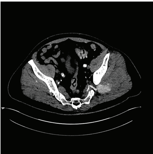
Figure 2. Contrast-enhanced computed tomography of the pelvis showing an area of contrast extravasations in the left gluteus medius muscle.

of mycotic gluteal artery aneurysm secondary to Streptococcus viridans [6]. A recent review of the literature revealed only six cases of mycotic aneurysm of the superior gluteal artery [7]. Streptococcus viridans has been reported in other rare cases of extracranial mycotic aneurysm including the superior mesenteric artery [8] as well as the popliteal artery [9]. The clinical presentations of these lesions are variable. Those include a pulsatile painful buttock mass, abdominal pain, nausea, vomiting, local hematoma, retroperitoneal hemorrhage and neurological deficit mainly due to compression of the sciatic nerve [3].