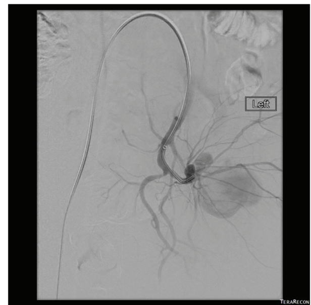
Figure 4. A selective left side internal iliac arteriogram showing a ruptured aneurysm with an associated large pseudoaneurysm.

The treatment of gluteal artery aneurysm has been, for a long time, exclusively through open surgery. Percutaneous