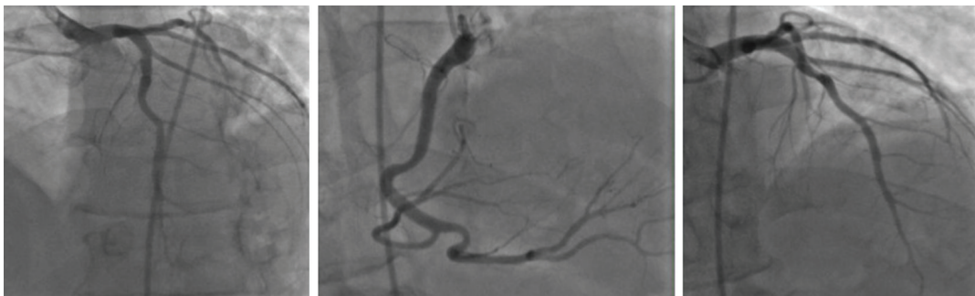
Figure 2. Cardiac catheterization illustrating patent arteries without any signs of occlusion or ischemia.

Viruses mediate toxicity through focal necrosis of myocytes in the absence of inflammatory cell infiltrate within 3