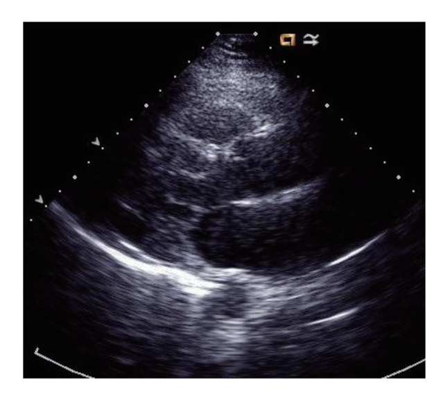
Figure 4. 2D echocardiogram repeated 1 month after treatment demonstrates resolving pericardial effusion.

Aspirin or NSAIDs remain the mainstay of treatment for pericarditis. NSAIDs should be administered at appropriate anti-inflammatory dosages (e.g. aspirin at 2 - 4 g daily, indomethacin at 75 - 150 mg daily, and ibuprofen at 1,600 - 3,200 mg daily). These treatments should be continued until complete normalization of CRP. Corticosteroids can be used in recurrent pericarditis but evidence is weak in supporting this treatment [2, 7, 13]. Colchicine 2 mg/day for 1 - 2 days, followed by a maintenance dose of 1 mg/day, has been recommended in some studies to treat recurrent pericarditis and is