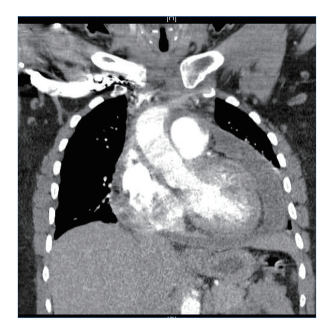
Figure 2. CT pulmonary angiography (CTPA).

Post-discharge follow-up 3 months later revealed new onset bilateral wrist pain and morning stiffness of unspecified duration. Pain was partially responsive to NSAIDs. The X-ray of the wrist revealed joint spaces were maintained. No erosive